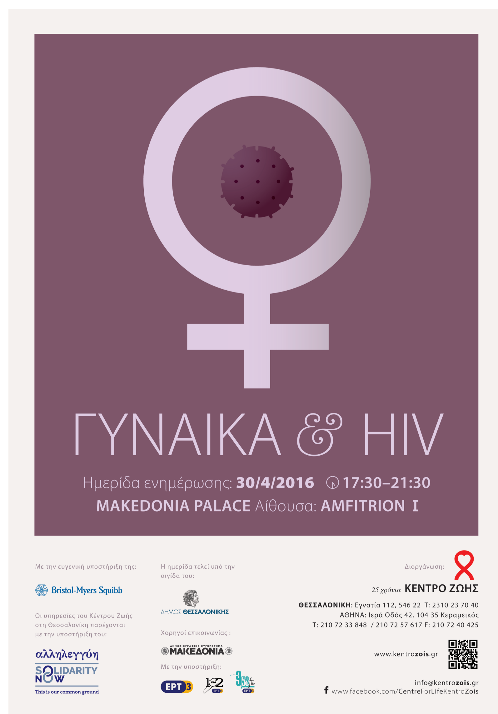
Woman & HIV Poster

→ Organizing educative and informative seminars (Last year's theme was “Woman & HIV”).